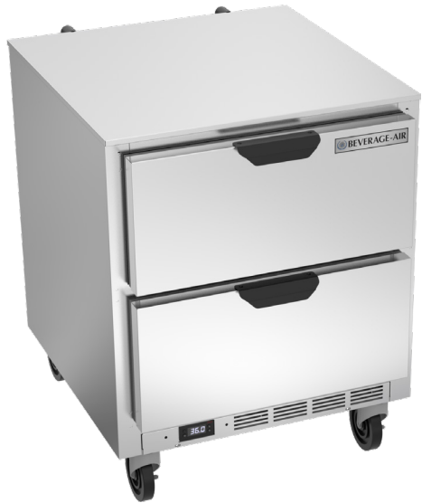
*Note: Shown with optional full electronic control

5 Year Parts/Labor Warranty Available 7 Year Compressor Warranty